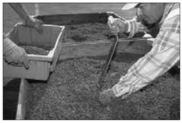
Figure 31.5 Inspectors use a 24-inch tempered spring steel prybar to facilitate sampling. The prybar allows inspectors to lift raisins and draw a sample from beneath the surface.