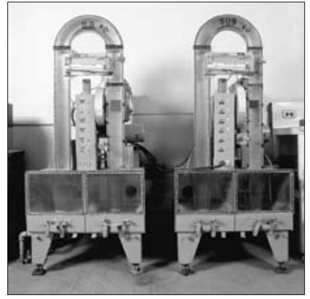
Figure 31.10 Airstream sorter machines are used to determine maturity. "Substandard" (Sstd) or "B or better" (B&B) raisin grades are sorted using a continuous airflow at a constant temperature and pressure.

deleterious material. Feathers (from both domestic and wild sources) cannot exceed four per bin. Any rock or hardpan material ¼ inch or larger is considered a rock. One rock per bin or sweat box determines presence, and the container is thus identified (ROCKS stamp) to aid the processor in rock removal. Contamination includes bunch rot, insect, and rodent contamination. Containers with contamination evidence are held for micro (microscopic analysis) and examined for compliance with U.S. Food and Drug Administration defect action levels.