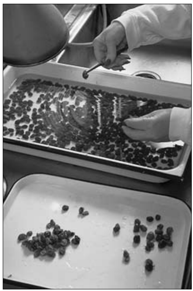
Figure 31.6 Moldy raisins are separated for scoring. Putrid mold (the most common) is scored if half or more of the berry is affected. Nodular mold covering one-eighth of the berry surface is scored. Split mold is scored if it extends one-half the length of the berry.