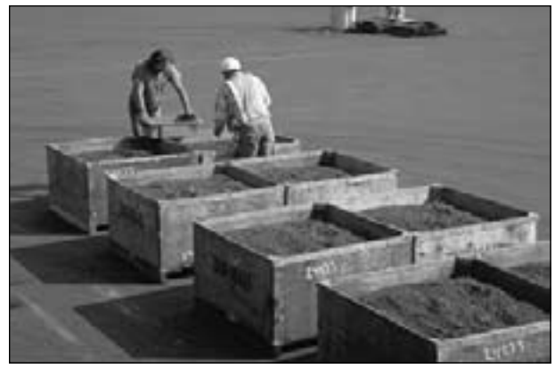
Figure 31.4 At most 75 percent of the bins are sampled without being dumped. Those bins are placed on the ground so the USDA inspector can sample each container.