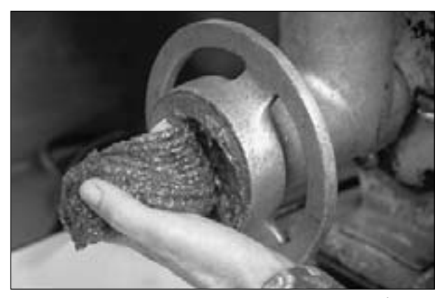
Figure 31.7 Laboratory technicians grind raisins into paste for moisture testing. The paste will be kneaded to remove air and help equalize the moisture in the sample.

‡'Ruby Seedless,' 'Black Imperial,' 'Beauty Seedless,' 'Blush Seedless' (sun-dried or dipped)