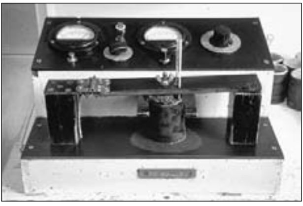
Figure 31.9 Accurate determination of moisture percentage requires that correction be made to compensate for temperature. The thermometer must be placed carefully into the raisin paste; it should not touch the probe or the cylinder.

20 minutes and separating the individual raisins containing sufficient amounts of mold. Only 5 percent by count of any mold type or combination of types is allowed. The three types of mold separated and scored after boiling are putrid (one-half or more of the raisin affected), split (one-half or more of the raisin length showing black discoloration in the split portion), and nodular (an aggregate of one-eighth or more of the surface affected).