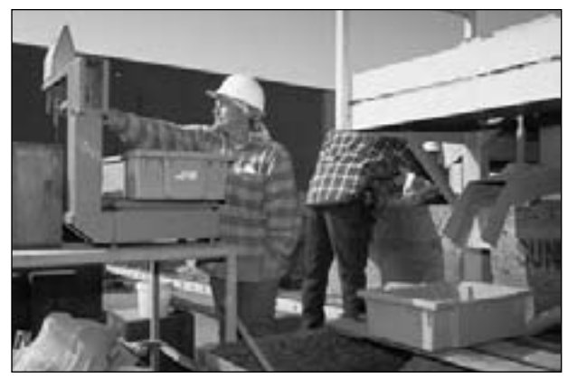
Figure 31.3 Sand that falls through the shaker is collected when bins are dumped. The sand is weighed and the average per bin is deducted from gross weight delivered.